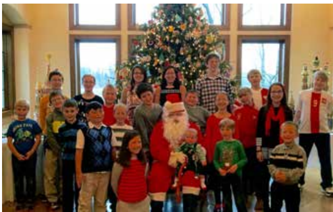
Council 8, Milwaukee, Wisconsin

Polish National Alliance subsidizes Christmas parties for its juvenile members across the country. For full gallery of Christmas 2015 photos visit: www.pna-znp.org