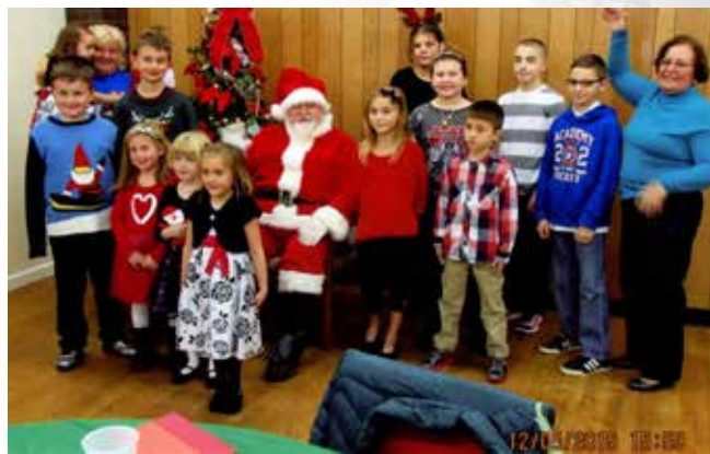
Lodge 1684 Cohoes, New York