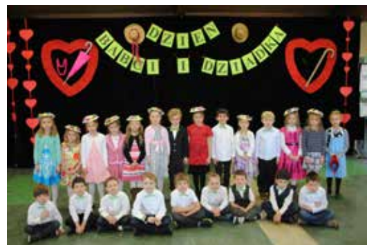
Klasa O a, tuż przed koncertem.

Send all articles, pictures and correspondence to: