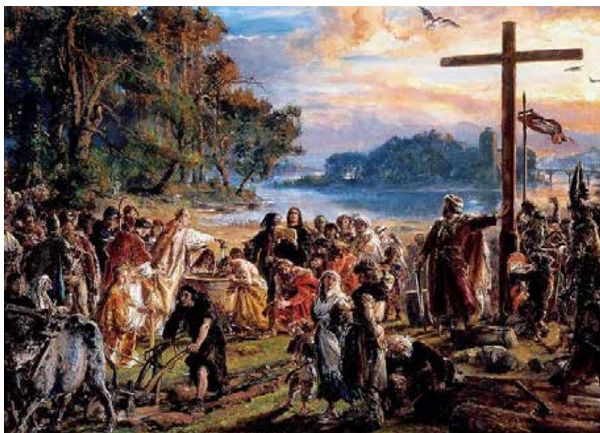
Jan Matejko: Christianization of Poland A.D. 966.

Boleslaw the Brave is widely considered one of Poland's most capable and accomplished Piast dynasty rulers.