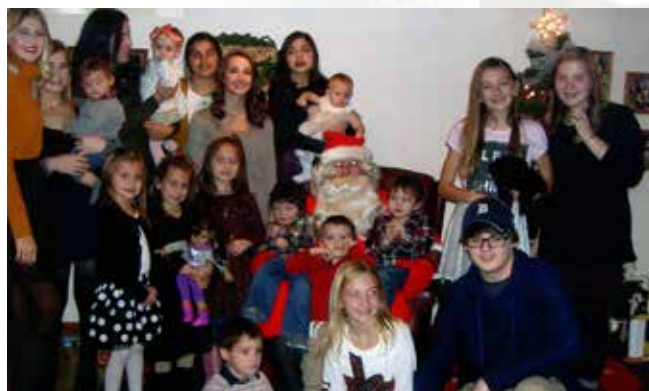
Lodge 2426, Wyandotte & Southgate Michigan