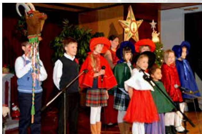
Lodge 156, Seattle, Washington