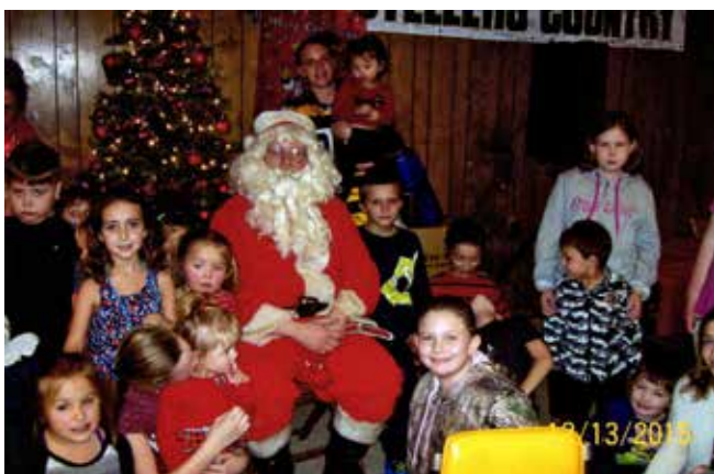
Lodge 599, Natrona, Pennsylvania