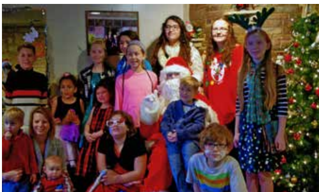
Lodge 1134 Eureka & St. Louis, Missouri