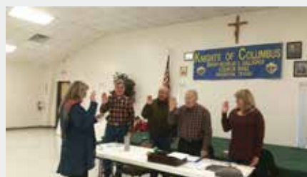
2017 Officers of Kosciuszko Lodge 165