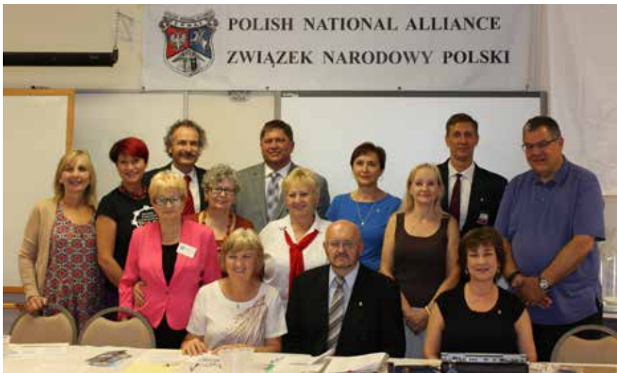
Delegates to District 16 Convention.