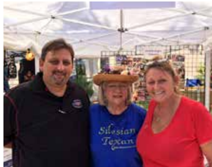
PNA members from San Antonio visited the PNA booth.