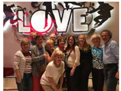
Time for some entertainment – "Love" by „Cirque du Soleil”.