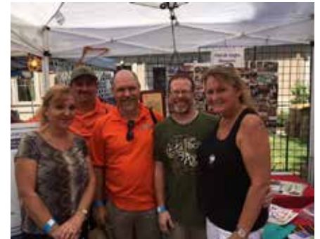
Former Polish Eagle Dance Group members.