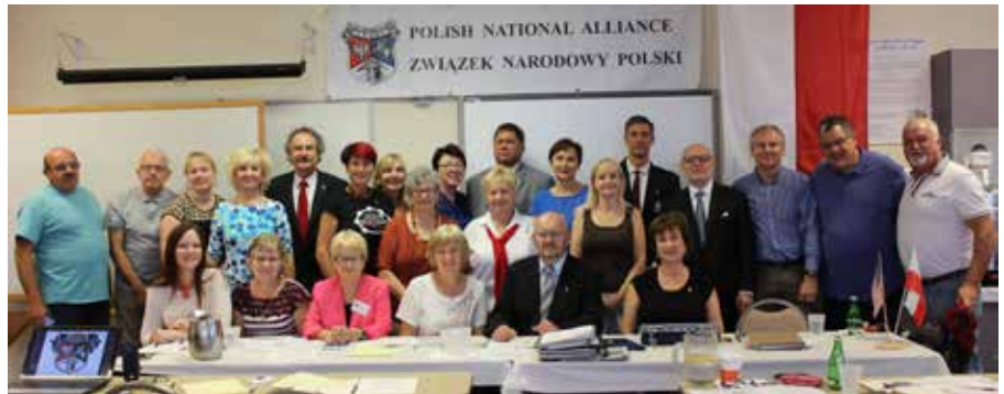
Delegates and guest of the District 16 Convention in Las Vegas, Nevada.