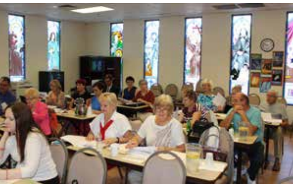
Delegates and guests of the District 16 Convention.

On October 15 and 16, 2016, Polish National Alliance, District 16 held its Convention („Sejmik”) hosted by Lodge 3281 of Las Vegas in the City of Las Vegas, Nevada. Since January 1st, due to changes in PNA District 16, it consists of only three states: California, Arizona, and Nevada; however, District 16 still seems to be the largest PNA District in USA. It has three councils with seventeen lodges. At the Sejmik, five lodges were represented. There were 13 delegates and 12 guests present. Among the guests were members of the Polish American Congress of Southern Cali-