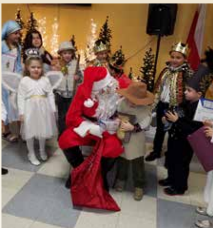
Święty Mikołaj obdarował dzieci słodyczami!

Śniadanie ze świętym Mikołajem zorganizowaliśmy, już po raz piętnasty, w niedzielę 4 grudnia. Wcześniej rano dzieci z rodzicami i dziadkami przyjechały do budynku ZNP, aby spotkać się na wspólnej zabawie. Impreza otwarta jest dla wszystkich dzieci, nie tylko tych, które są członkami ZNP i jest okazją do promowania naszej Organizacji oraz podkreślenia, jak ważne są dla nas dzieci – nasz przyszłość. Profesjonalnie przygotowany program gier i zabaw i pyszne śniadanie sprawiły, że i dzieci i rodzice bawili