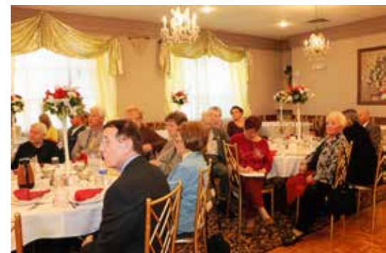
District 12 Convention 10-23-2016