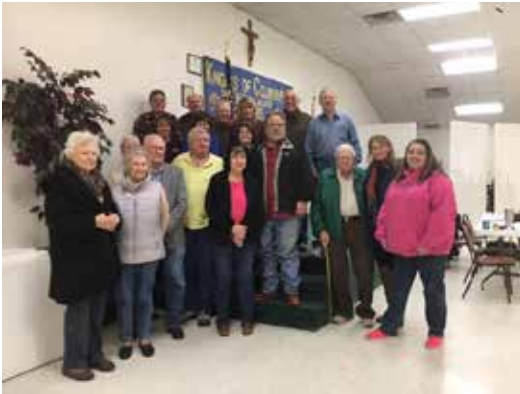
Members of Council 182.