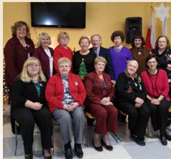
Goście i gospodarze bożonarodzeniowego przyjęcia.

Śniadanie ze świętym Mikołajem zorganizowaliśmy, już po raz piętnasty, w niedzielę 4 grudnia. Wcześniej rano dzieci z rodzicami i dziadkami przyjechały do budynku ZNP, aby spotkać się na wspólnej zabawie. Impreza otwarta jest dla wszystkich dzieci, nie tylko tych, które są członkami ZNP i jest okazją do promowania naszej Organizacji oraz podkreślenia, jak ważne są dla nas dzieci – nasz przyszłość. Profesjonalnie przygotowany program gier i zabaw i pyszne śniadanie sprawiły, że i dzieci i rodzice bawili