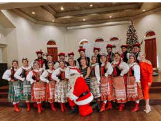
Santa with Dance Group Wawel who performed amazingly – Thank you!