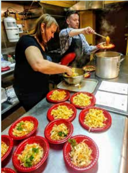
Breast Cutlets with Vegetable Letch

April 4th: Creamy Vegetable Soup, Tomato Soup with Batter Noodles, Barley Soup with Wild Mushrooms and Smearcase Cake.