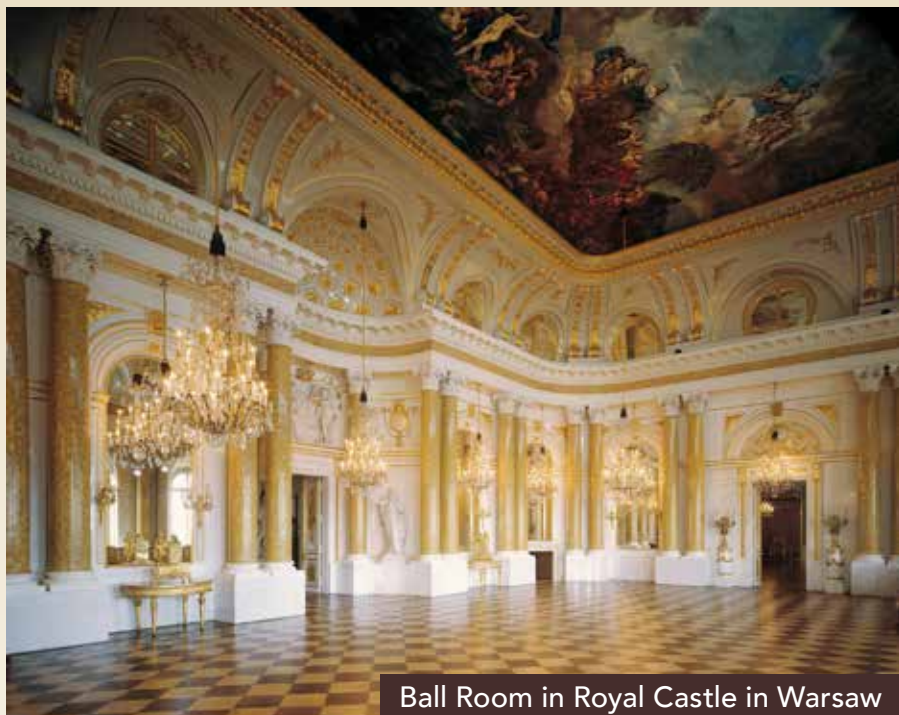
Ball Room in Royal Castle in Warsaw

The carnival celebrations in Poland officially begin January 6th on Three Kings' Day and end when Lent begins on February 26th. This period is also known as zapusty (shrovetide). Throughout Europe, carnival celebrations originated in ancient winter rituals that honored the gods of fertility. The word 'carnival' derives from the word, 'carnavale' which roughly translates to 'goodbye meat.' People would fill their stomachs with meaty meals before completely abstaining from them during Lent.