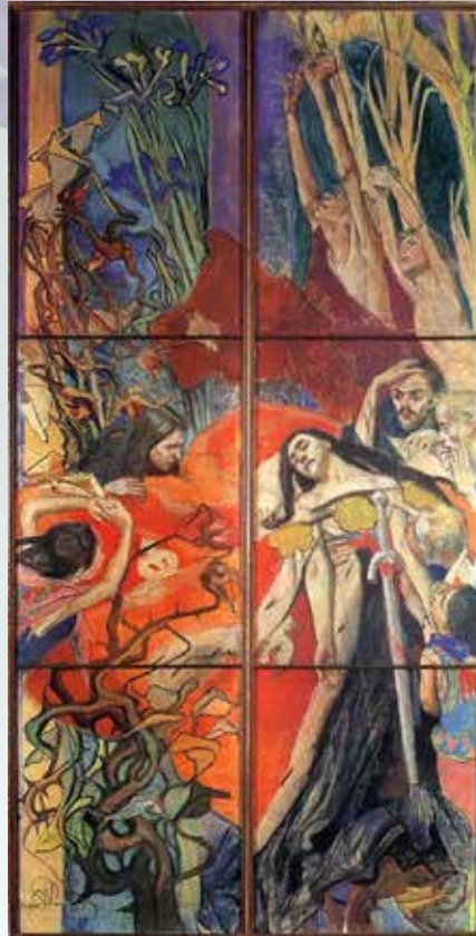
Stanisław Wyspiański, "Polonia"