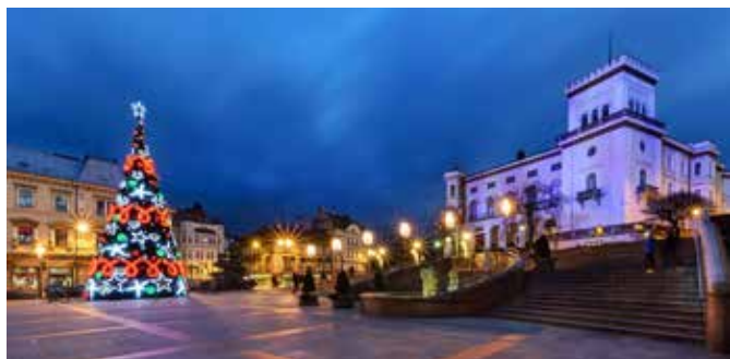
City Castle in Bielsko-Biała.

Bielsko-Biała sits on the opposite banks of the Biała River. Many hikers looking to hike Szyndzielnia Mountain or the nearby Beskid Mountains stay in Bielsko-Biała. The city is also home to several ski resorts, including the trendy Szczyrk resort. The city of Żywiec is within the Bieskid Mountains and is also a popular winter sports destination. Żywiec is also famous for being where the most famous Polish beer, “Żywiec,” is made.