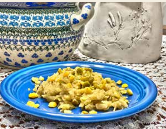
Sauerkraut with peas Kapusta z grochem

Are you looking for a gift for neighbors or coworkers? How about a box of homemade Pierniki?