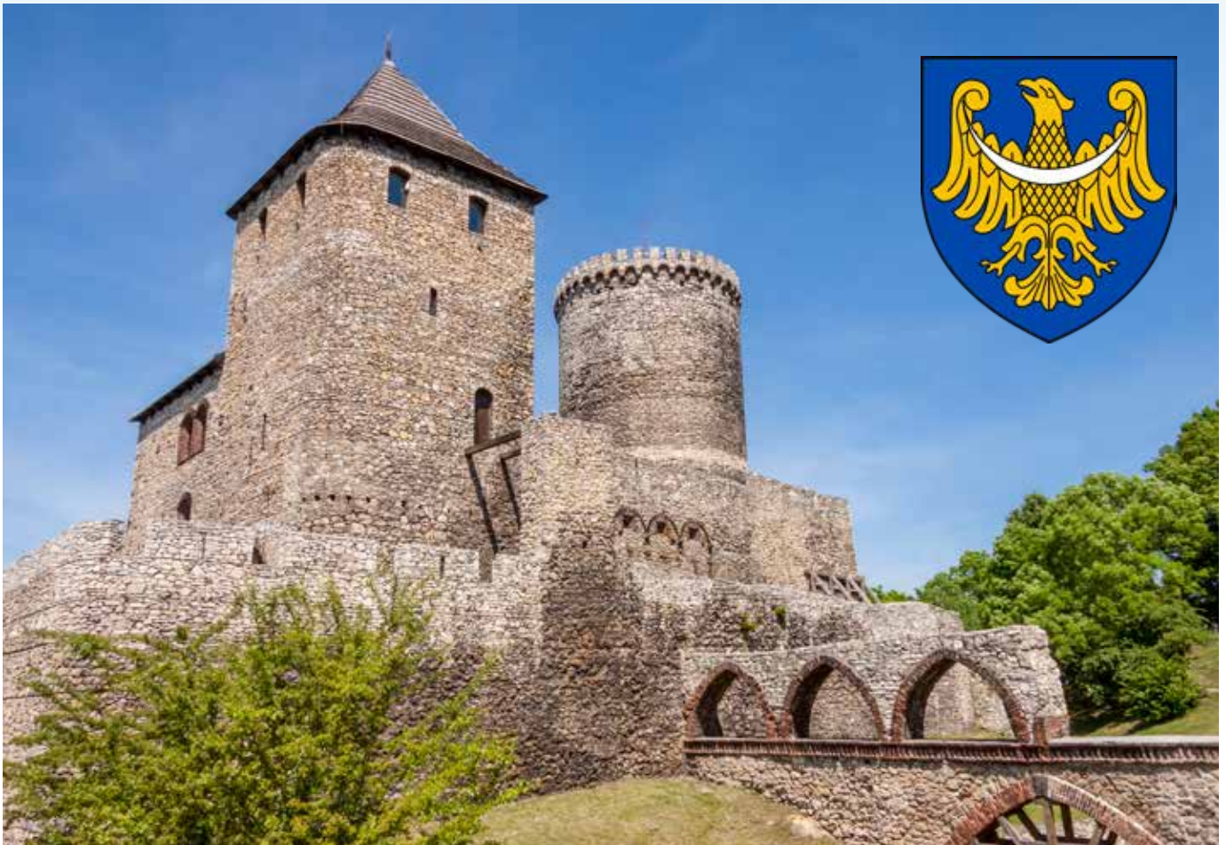
Medieval Castle in Będzin. Silesia coat of arms.

only the 11th most populous city in Poland, Katowice has the 7th largest number of workers and regularly ranks as an area one of Poland's lowest unemployment rates. It is second only to Warszawa in the number of commuters coming from other municipalities to work in the city.