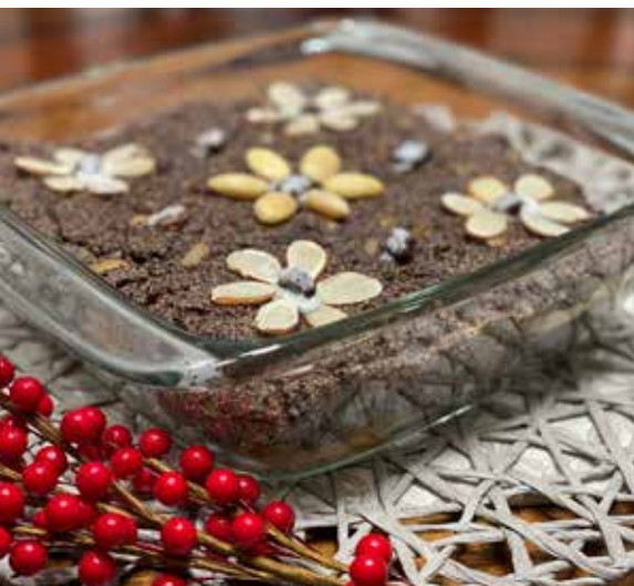
Poppy Seed Christmas Dessert Makówki

Rinse the peas and let them soak for several hours, each kind separately. Boil the peas in the same water, each one individually. Chop the sauerkraut with a knife, add the bay leaf and cook until soft but not soggy (add some water). Mix the sauerkraut with the peas (leave some whole peas to decorate the plate). Combine oil/butter, chopped onion, and flour in a small skillet, and prepare a roux. Mix the roux into the sauerkraut and peas. Add salt and pepper to taste.