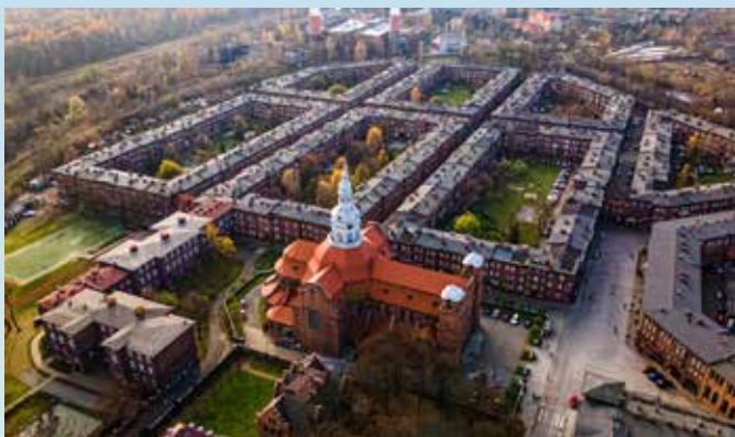
Nikiszowiec housing estate in Katowice.

Katowice also has a very thriving music scene. It is the seat of the internationally renowned Karol Szymanowski Academy of Music and the Silesian Philharmonic. Katowice also hosts several award-winning music festivals, including Off Festival and Tauron New Music. Other music festivals held in Katowice include the Silesian Jazz Festival, the Rawa Blues Festival, and the Mayday Festival. In 2015, Katowice was named a UNESCO City of Music and joined the UNESCO Creatives Cities Network.