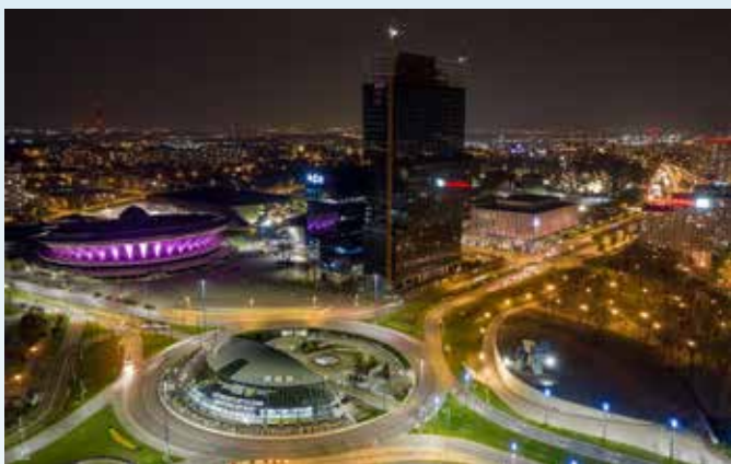
Spodek Arena in Katowice.

Katowice also has a very thriving music scene. It is the seat of the internationally renowned Karol Szymanowski Academy of Music and the Silesian Philharmonic. Katowice also hosts several award-winning music festivals, including Off Festival and Tauron New Music. Other music festivals held in Katowice include the Silesian Jazz Festival, the Rawa Blues Festival, and the Mayday Festival. In 2015, Katowice was named a UNESCO City of Music and joined the UNESCO Creatives Cities Network.