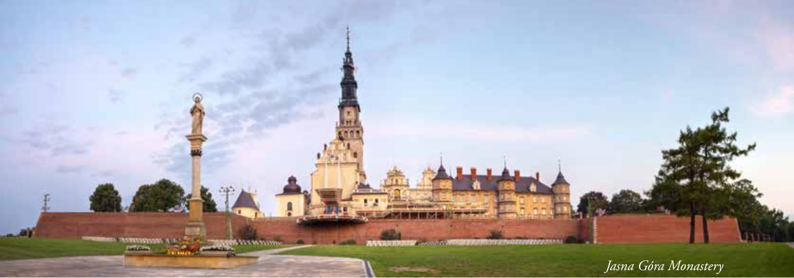
Jasna Góra Monastery