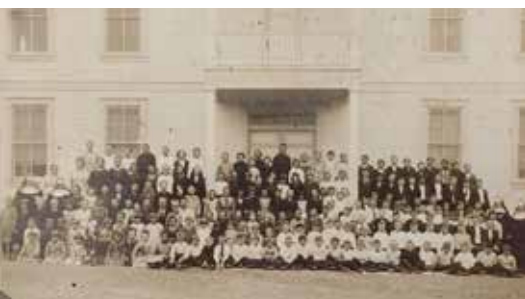
One of the original classes at this historic Polish Church