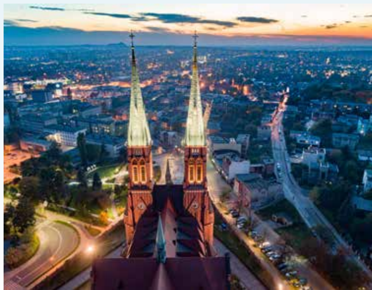
Basilica and city center in Rybnik.

Rybnik is located on two rivers: The Nacyna and the Ruda, which both eventually flow in the Odra River. The city was a fishermen's settlement during the Middle Ages, and it is thought that the city's name originated from the Polish word for fish (Ryba). The large selection of parks, squares, and gardens has earned Rybnik the reputation of "the green city of Silesia." Kwietnik magazine awarded Rybnik first place in their contest for the most flowered Polish city.