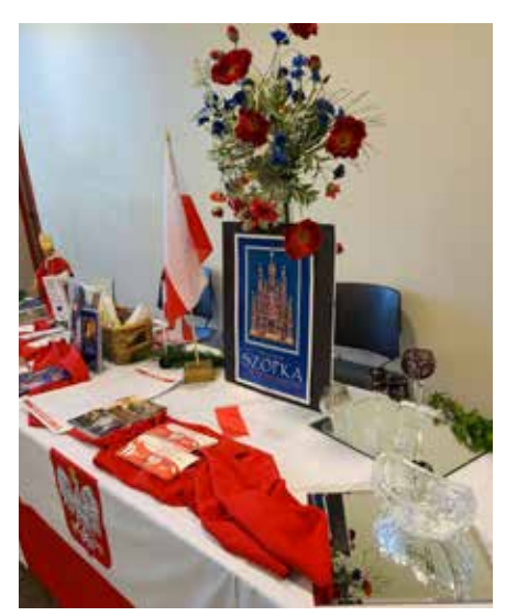
Display of Polish artifacts and information.

Guests enjoyed the afternoon and thanked the presenters for a wonderful afternoon.