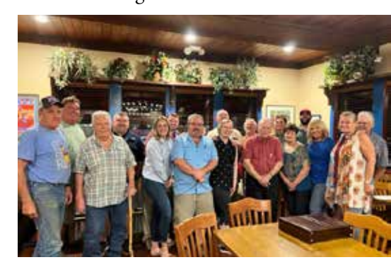
Houston Polish Harvest Festival – Dożynki

Many exciting plans have been established until the end of the year. The PNA groups discussed various new ideas and made plans to sponsor numerous exciting events.