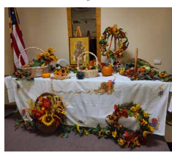
The Harvest Table with baskets & wreaths to symbolize the villagers' contributions to the harvest.