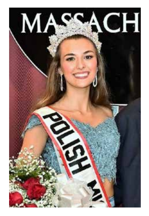
THE POLISH MISS MASSACHUSETTS 2023 WINNERS

homemade Polish food, dancing, entertainment, and fun for everyone.