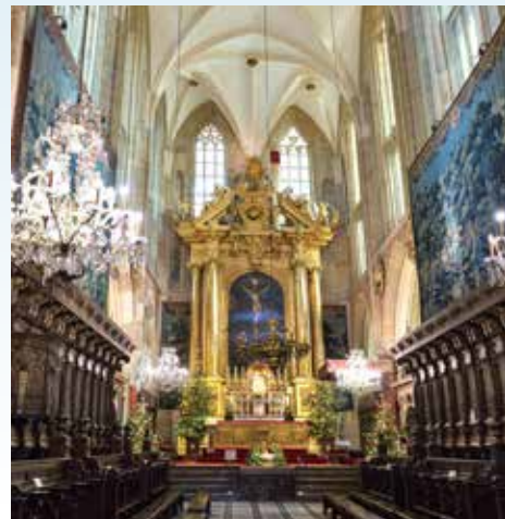
Wawel Cathedral Interior

Constructed in the 14th century, visitors cannot miss the Wawel Cathedral. The cathedral remains functioning today, and Catholics are welcome to attend Holy Mass. Wawel Cathedral's chapels and crypts are the final resting place of many distinguished rulers, bishops, political figures, and artists.