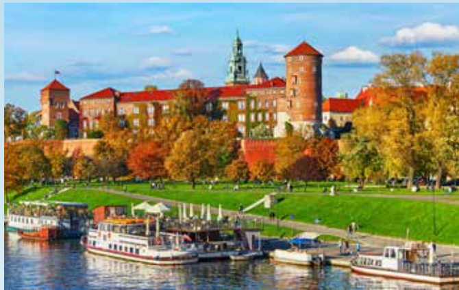
View From the Vistula River

The ruler's seat and royal residence were established at Wawel in the first half of the 11th century during the rule of Boleslav the Brave and Mieszko III. The castle underwent numerous expansions in the following centuries until arriving at its present appearance during the beginning of the 16th century.