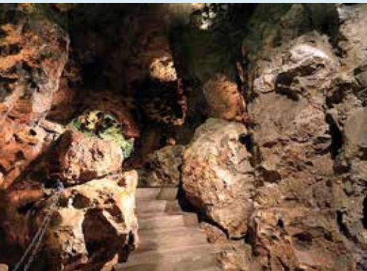
Creepy Dragon's Den

A royal castle of such stature needs to have an even greater legend accompanying it, and nothing can beat the excitement of a fire-breathing dragon causing turmoil. Beneath Wawel Hill lies a limestone formation about 25 million-