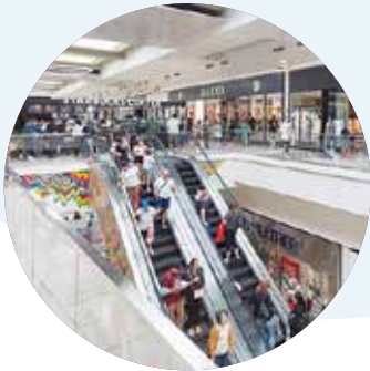
Fashion Outlets of Chicago 5220 Fashion Outlets Way Rosemont, IL 60018

Located just outside of Chicago, Rosemont, IL, is a bustling suburb known for its entertainment options and attractions. These attractions are within walking distance or a short ride away from the Hyatt Regency O'Hare Chicago where you will be staying. Staying an extended period? Book a show or attend an event at one of Rosemont's premier entertainment centers. Here are just a few attractions out of many: