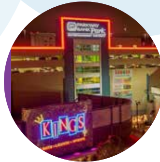
Parkway Bank Park + Entertainment District 5501 Park Place Rosemont, IL 60018