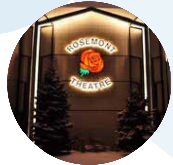
Rosemont Theatre 5400 N. River Road Rosemont, IL 60018