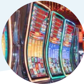
Rivers Casino 3000 S. River Road Des Plaines, IL 60018